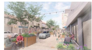
THE 'renaissance' of Keynsham's Temple Street is coming and residents are being urged to have their say.

Concept drawings show some of the on-street parking that 'dominates' the street removed to make way for pavement licences, planters and 'parklets'. The £1.1 million, four-year heritage action zone project aims to reunite the two sides of the street, make it greener with a community garden and 'edible' bus stop and strengthen its identity as an independent part of the town centre.